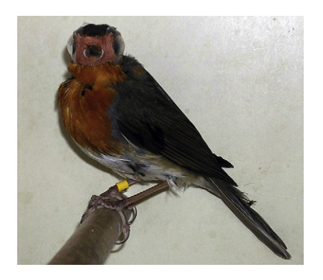
Figure 1. A subject of the experiments of Stapput et al. [3].

European robin, fitted with goggles that allow equal amounts of light to reach both eyes, but vary between the eyes in permitting access to detailed vision. This bird has a frosted lens over its left eye and a clear lens over the right: Stapput et al. 's [3] results suggest that its ability to perceive object contours by the right eye means that it also has access to a fully functioning magnetic compass.